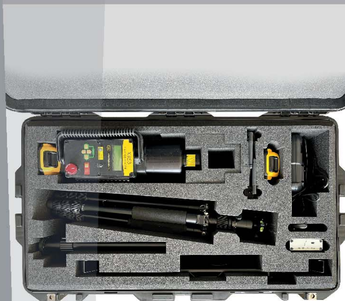
[Generator incl. generator accessories are not included in the scope of delivery].